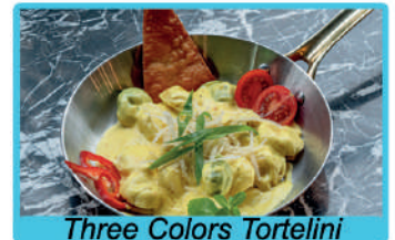
Three Colors Tortellini