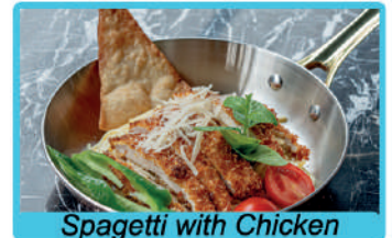
Spagetti with Chicken